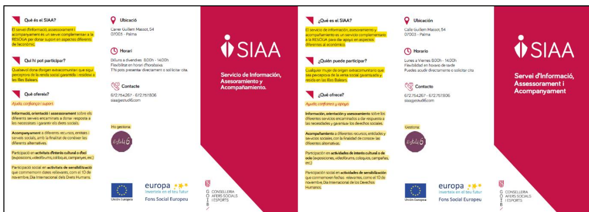
Illustration 2: Leaflet on the SIAA.