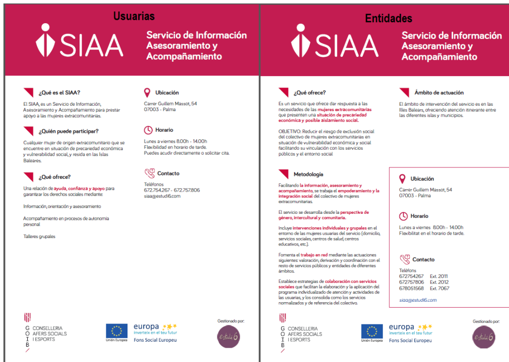
Illustration 4: Information material aimed at potential beneficiaries and professionals.