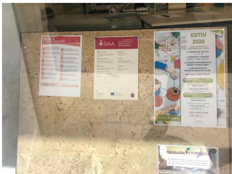
Illustration 5: Dissemination of SIAA at the headquarters of Estudi 6 Gestió Socioeducativa, S.L.