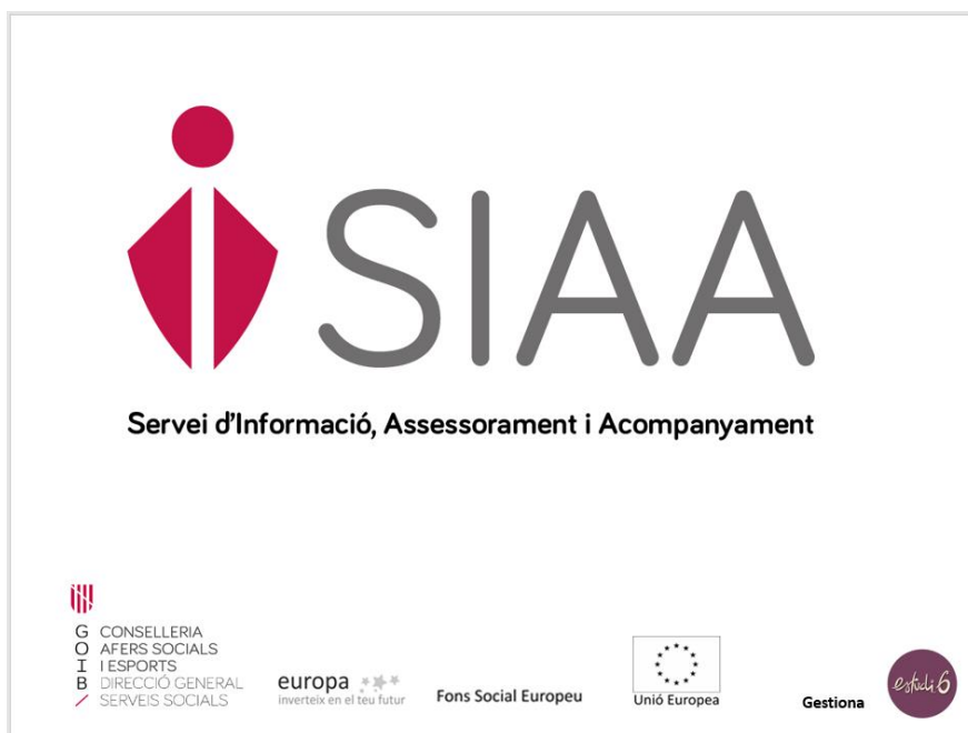
Illustration 6: Cover of the Powerpoint shown at the SIAA training meetings.

In view of the above, this action presents an appropriate dissemination strategy that complies with the Fund's communication requirements, based on: information tables with professionals, resources and entities; group information sessions with participants; individual information sessions; paper posters for entities and users; information leaflets; dissemination of the service via e-mail and dissemination in the SRs of the entities with which they are coordinated.