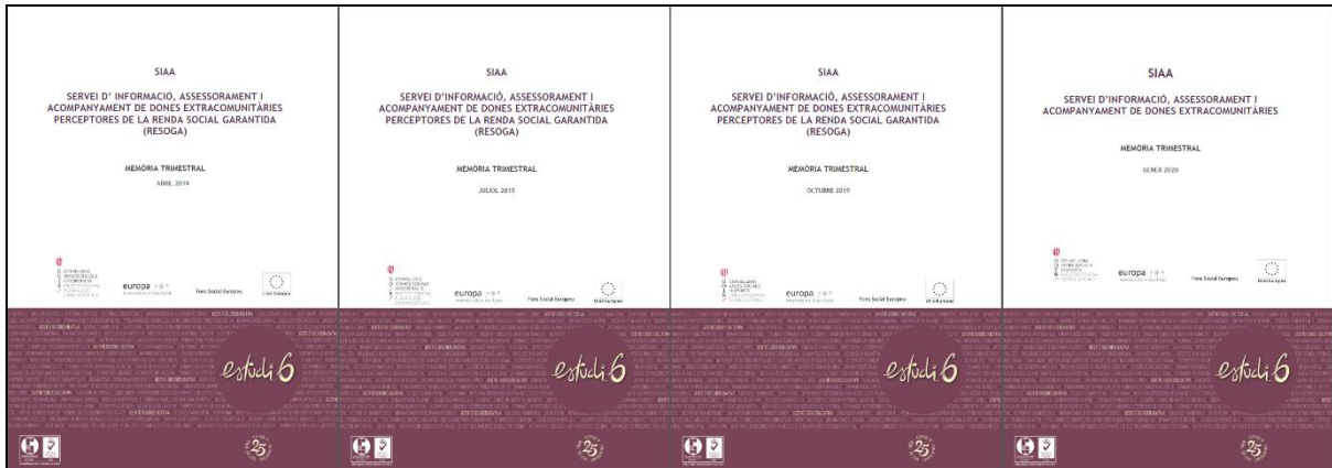
Illustration 3: Quarterly reports of SIAA by Estudio 6.

They show the evolution of the activity, its development and the assessment of the impact of the programme itself. The typology of the woman benefiting from the service, the results obtained previously in the different actions carried out and the care offered by the SIAA according to the typology of demand/need presented by the participants are made visible.