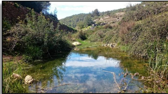
Torrent des Buscastell.

The Torrent des Buscastell passes through the valley and is partly fed by Es Broll.