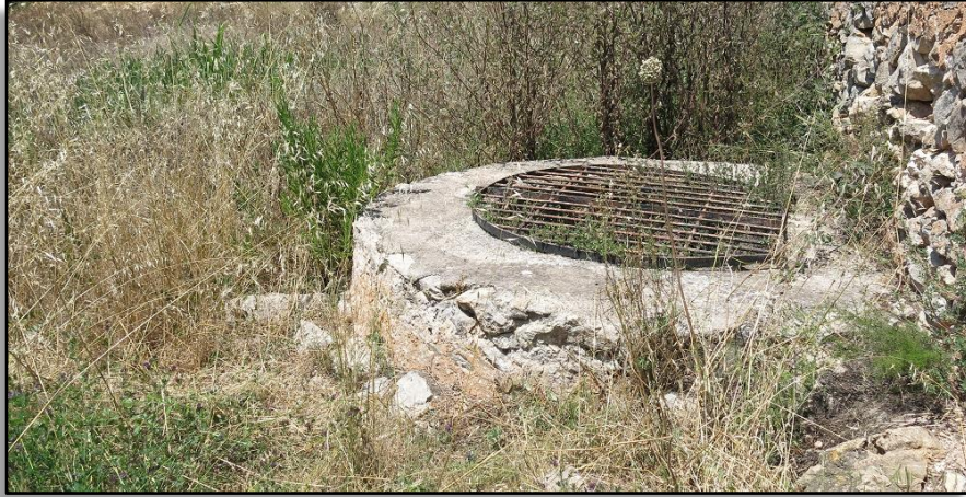
Es Broll des Buscastell delimited and protected.