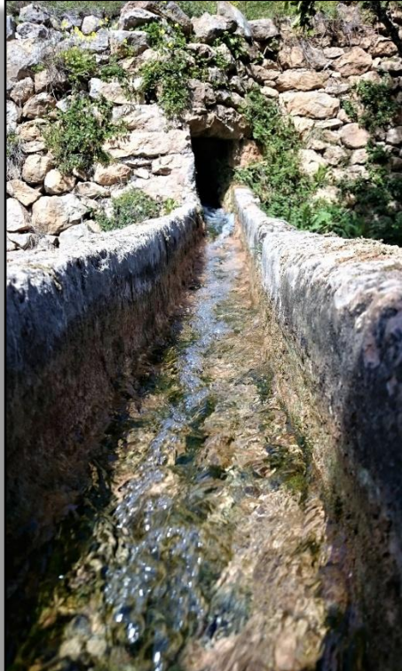
Exit of the water via one of the irrigation channels of the spring.

This natural spring has been known since ancient times. In fact, it was during the Muslim occupation when this natural resource was first exploited systematically, with the construction of a system of irrigation channels that are still very useful today for the local agriculture, thanks to the maintenance and alterations carried out. The nearby village of Santa Agnès is the one which traditionally has most benefited from the water of the spring.